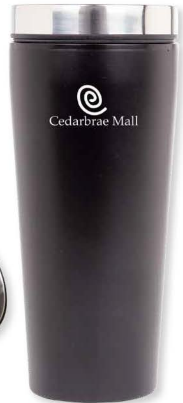
D767BK | BLACK