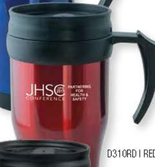
D310RD | RED