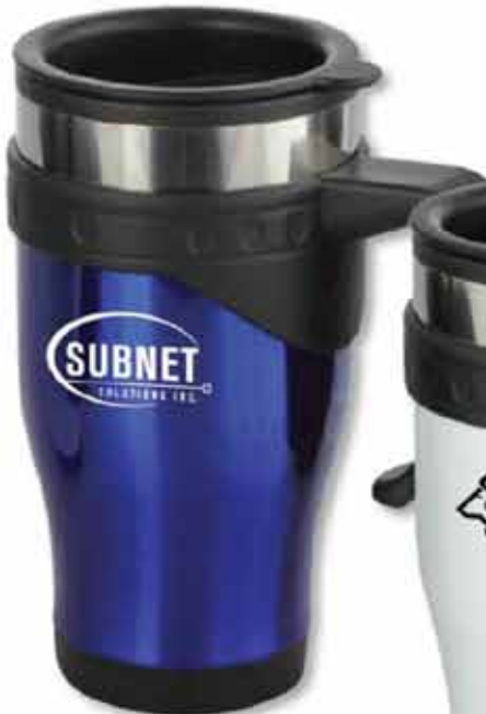
D333NV | NAVY