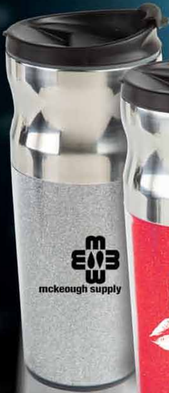
D289SV | SILVER