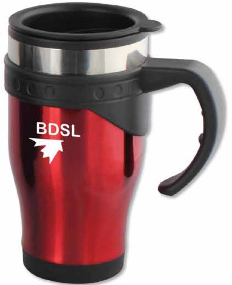
D333RD | RED