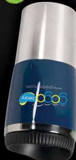
D950BL | BLUE