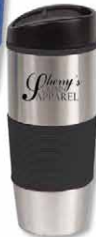
D761BK | BLACK