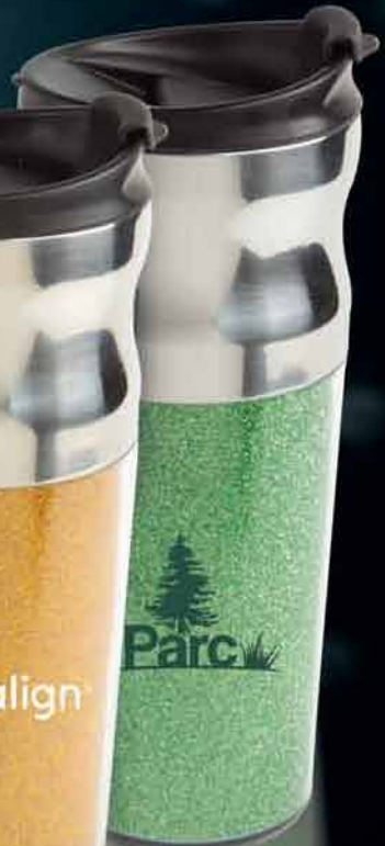
D289GN | GREEN