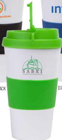
D797GN | GREEN