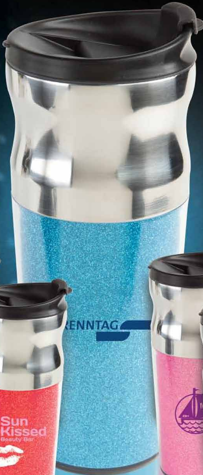
D289BL | BLUE