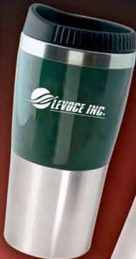
D950HG | HUNTER GREEN