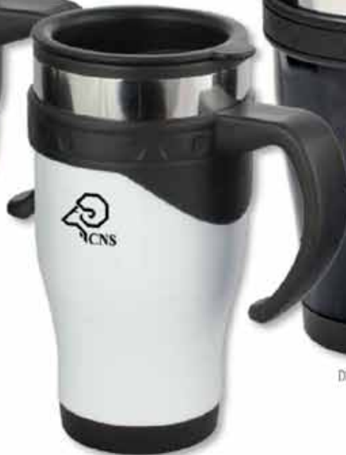
D333WH | WHITE