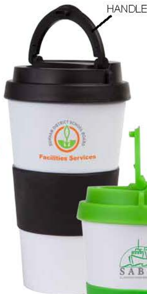
D797BK | BLACK