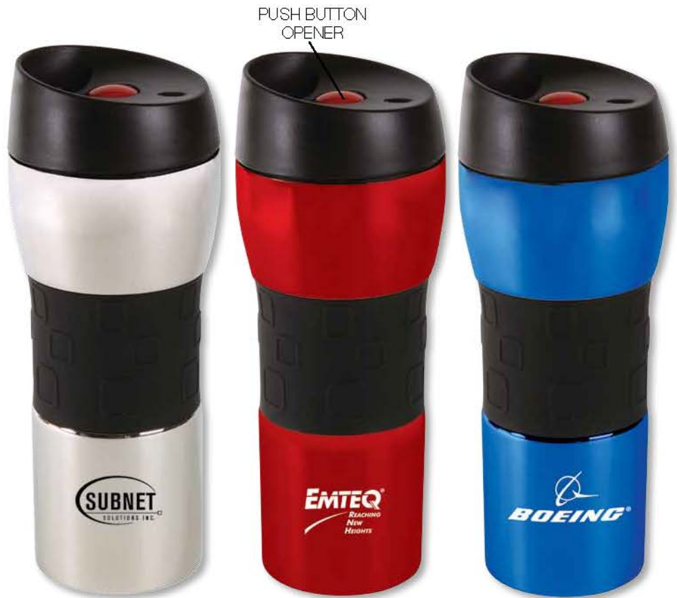
D759SV | SILVER