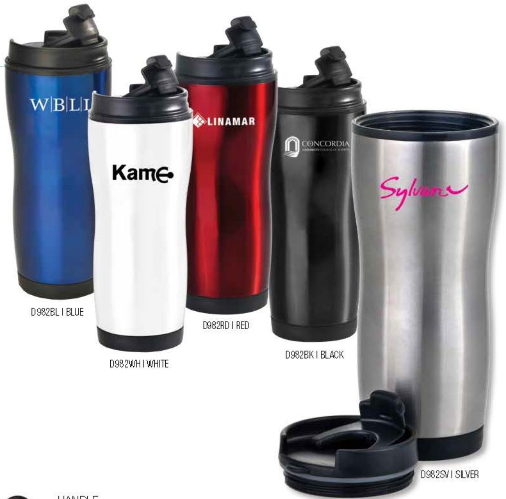
D982BL | BLUE