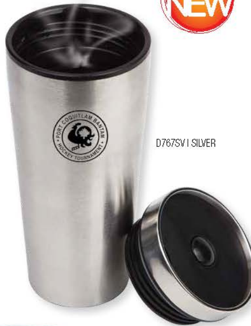
D767SV | SILVER