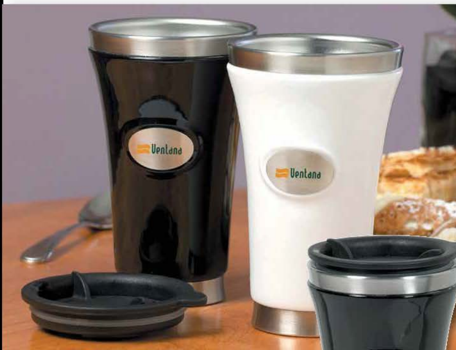
D501BK | BLACK