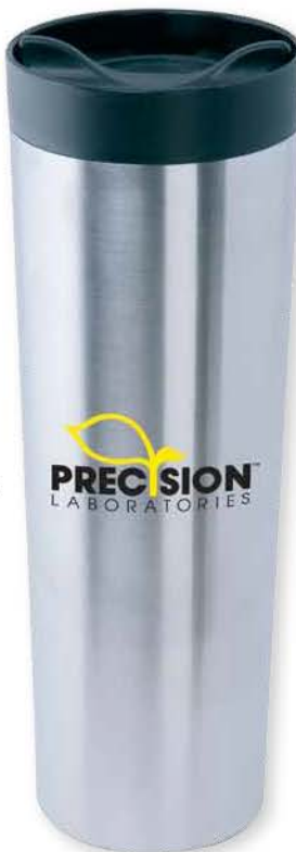
D286BK | BLACK