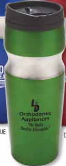
D288GN | GREEN