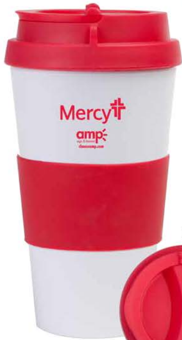
D797RD | RED