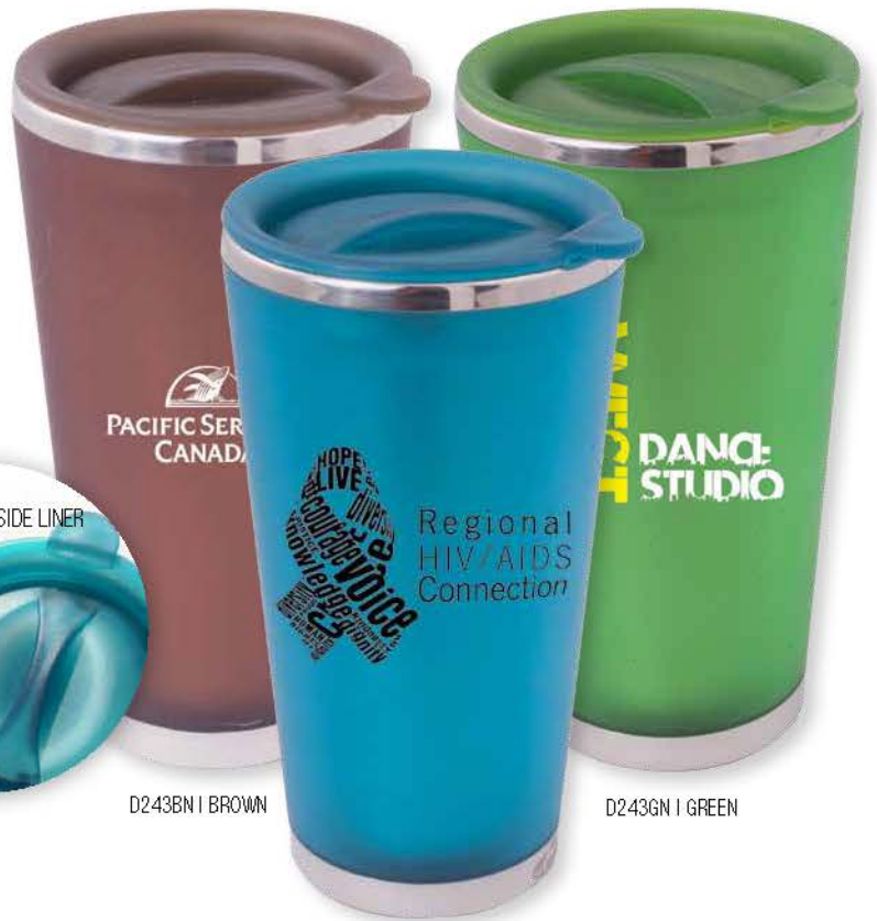
D243BN | BROWN