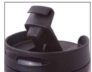
D261CP D260SV | LID