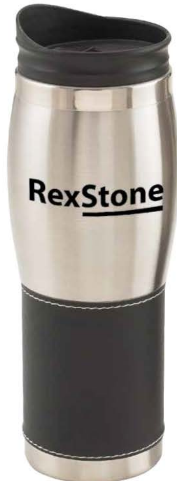
D417BK | BLACK