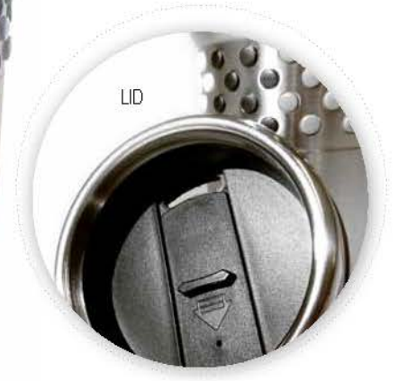
D446BK | BLACK