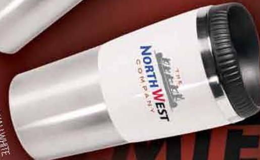
D950WH | WHITE