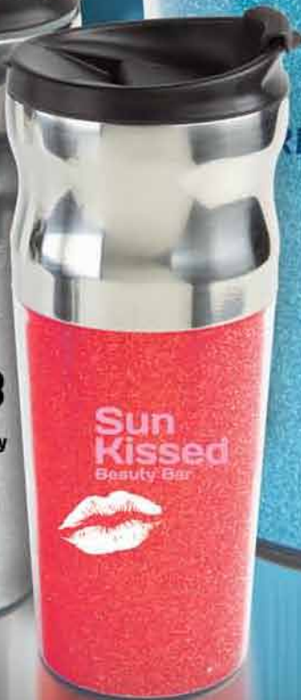
D289RD | RED