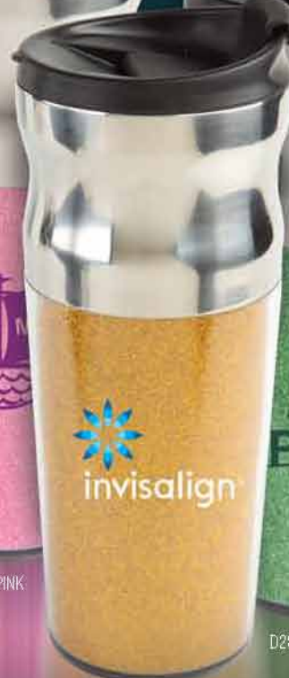
D289GD | GOLD