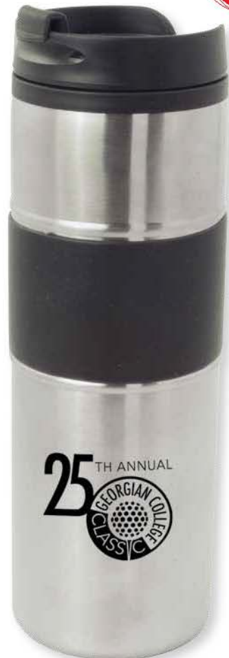
D260SV | SILVER