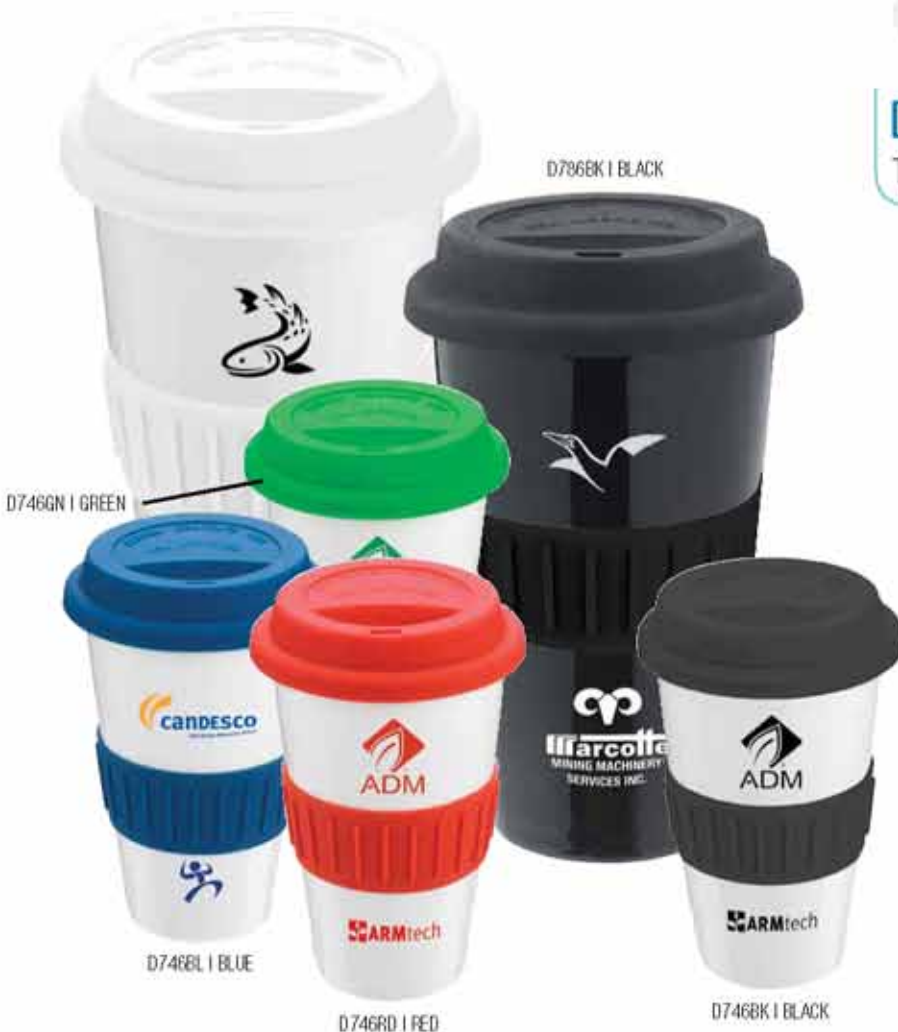
D746BL | BLUE