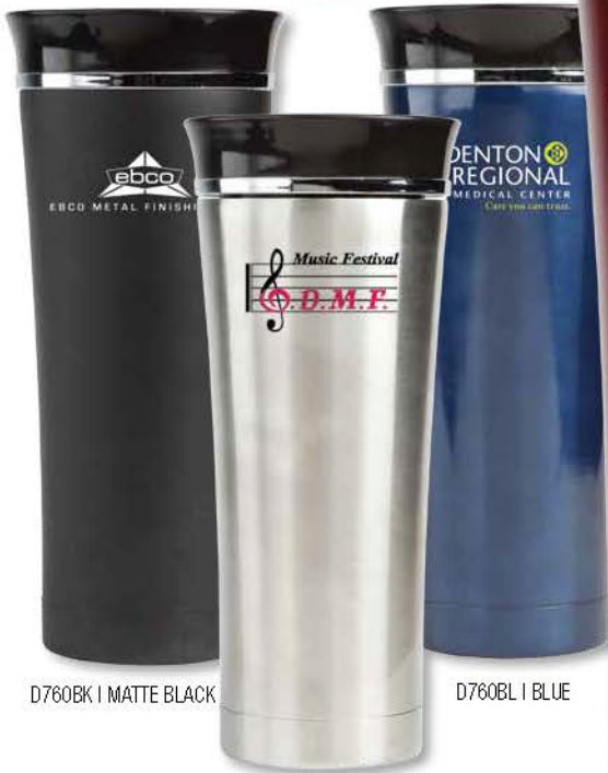
D760BK | MATTE BLACK