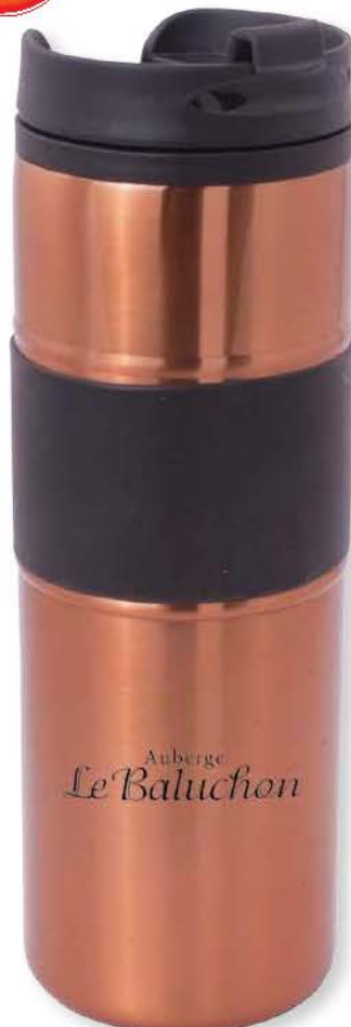
D260CP | COPPER