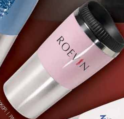
D950PI | PINK