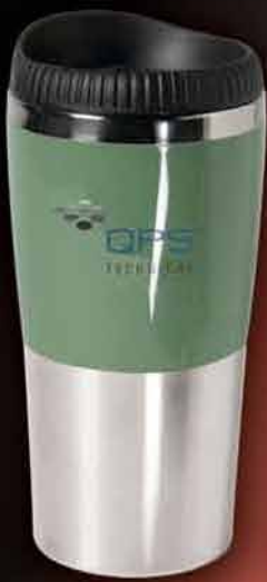
D950GN | GREEN