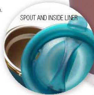
SPOUT AND INSIDE LINER