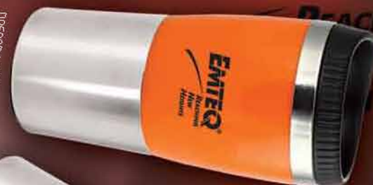
D950OR | ORANGE