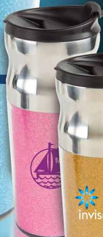
D289PI | PINK