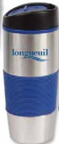
D761BL | BLUE