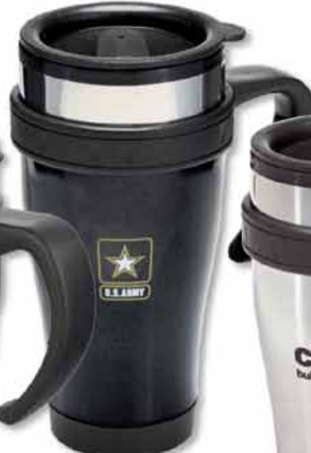
D333BK | BLACK