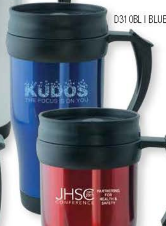
D310BL | BLUE