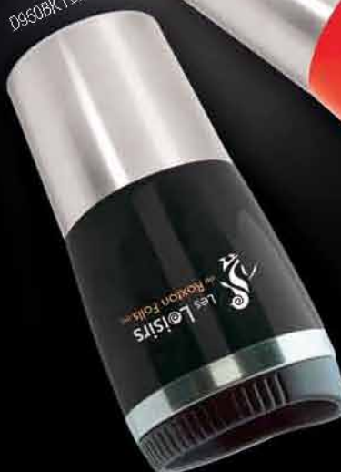
D950BK | BLACK