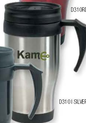
D310SI | SILVER