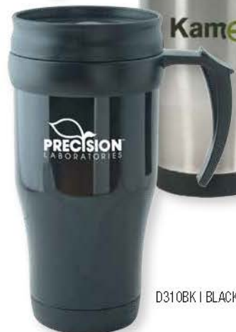
D310BK | BLACK