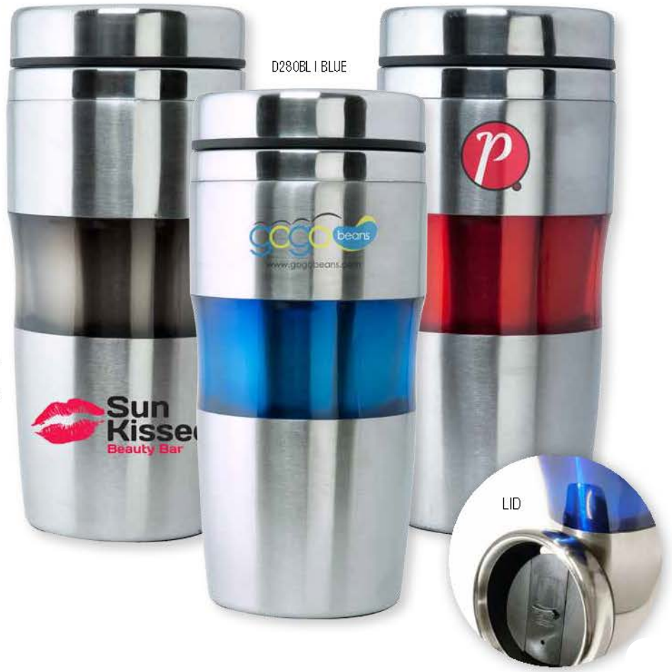
D280BL | BLUE