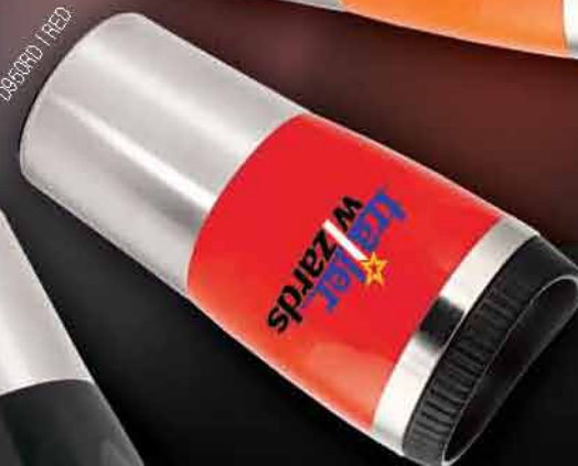
D950RD | RED