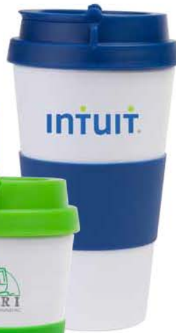
D797BL | BLUE