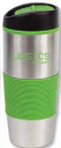
D761GN | GREEN