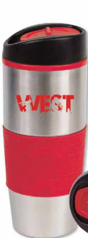
D761FD | RED