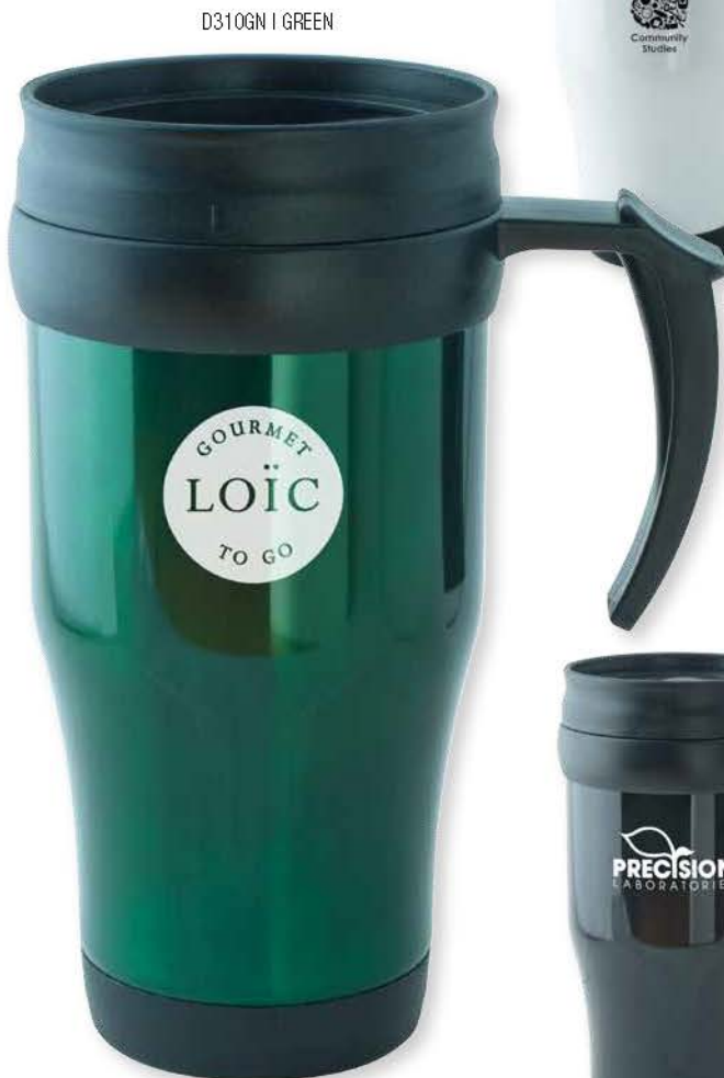
D310GN | GREEN