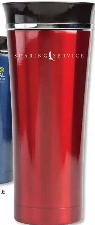
D760RD | RED