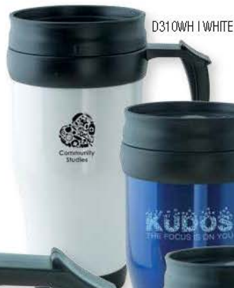
D310WH | WHITE