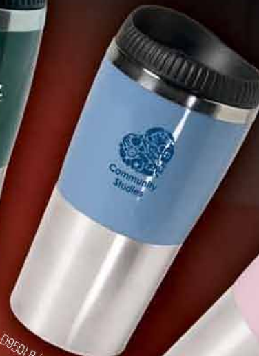
D950LB | LIGHT BLUE