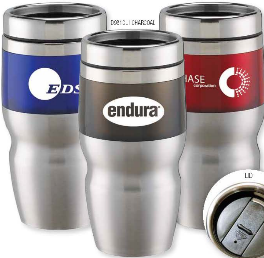
D981CL | CHARCOAL