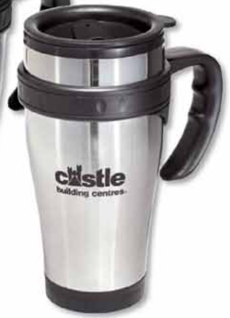
D333 | SILVER