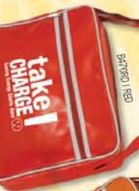
B470RD | RED

Low-ink fabrication according to accepted best standards