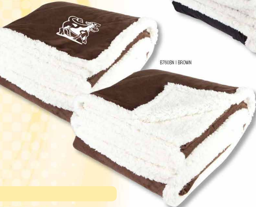
B760BN | BROWN