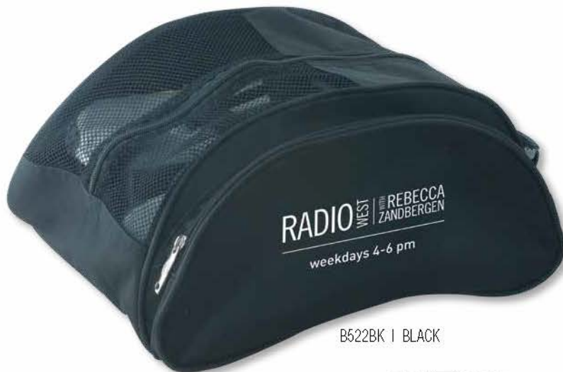
B522BK | BLACK