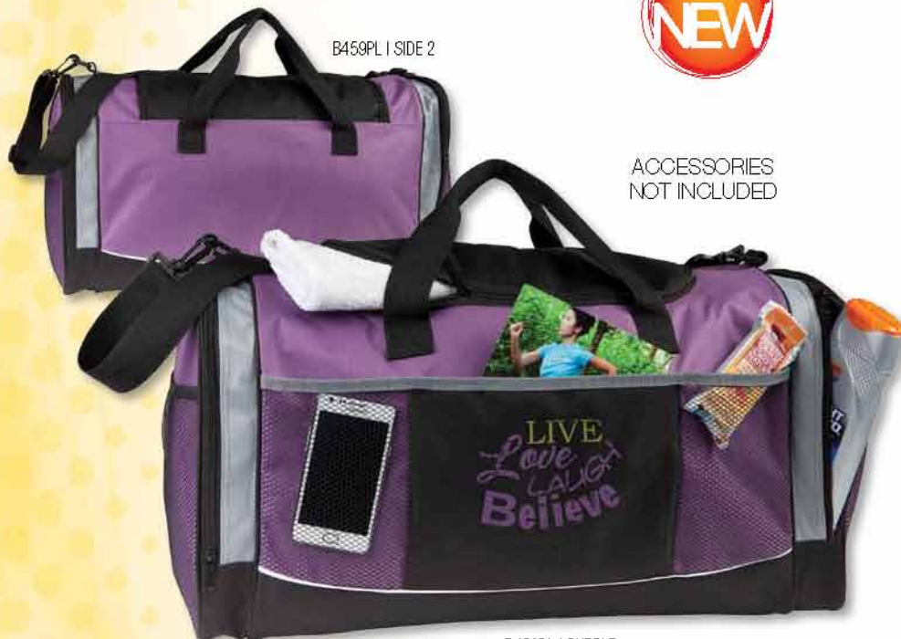
B459PL | SIDE 2

Lead with information according to accepted best standards