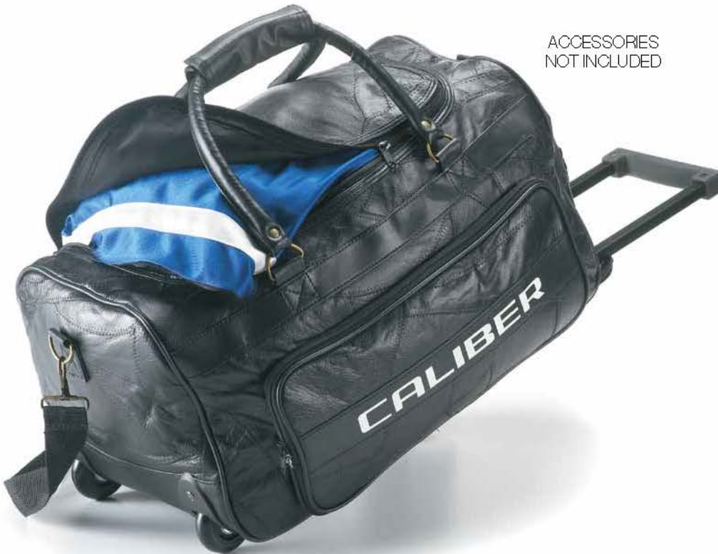
B813 | GENUINE LEATHER