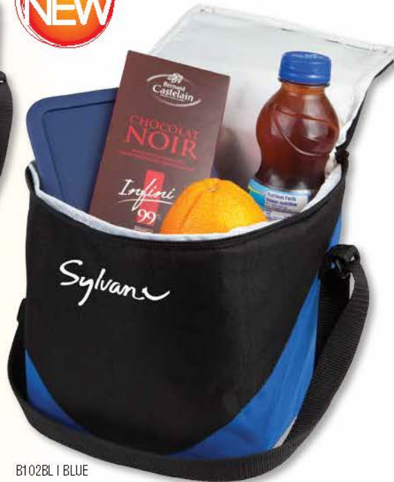
B102BL | BLUE