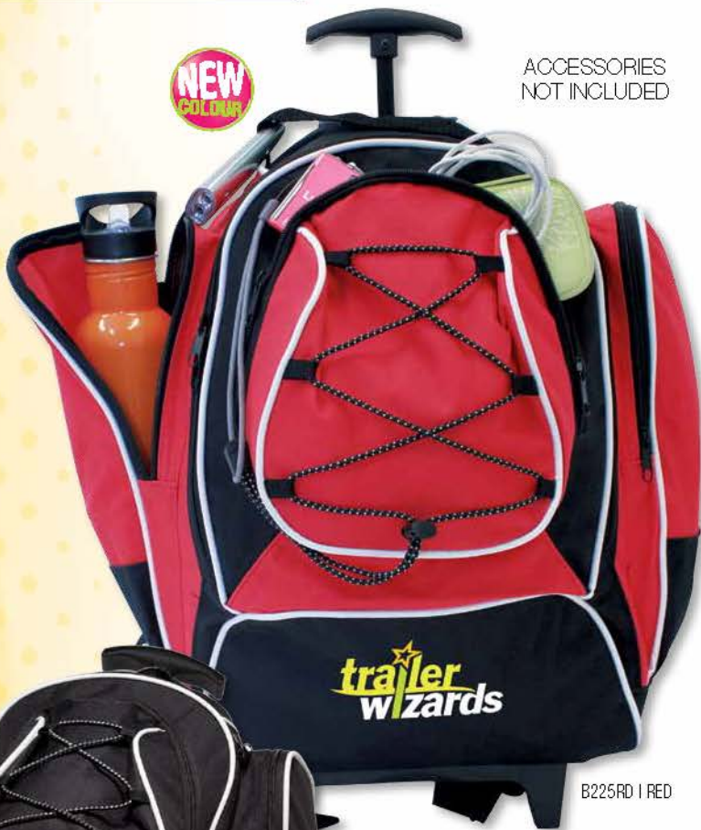
B225RD | RED

Lead-safe inks fabricated according to accepted best standards