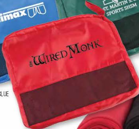
B131RD | RED