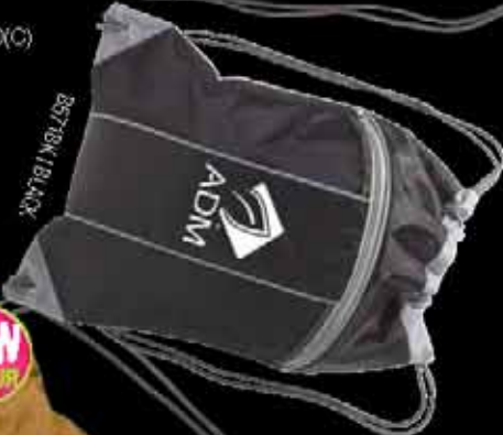
B571BK | BLACK