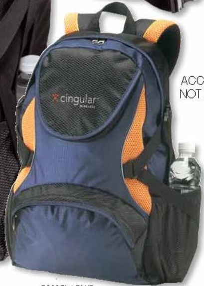
B232BL | BLUE