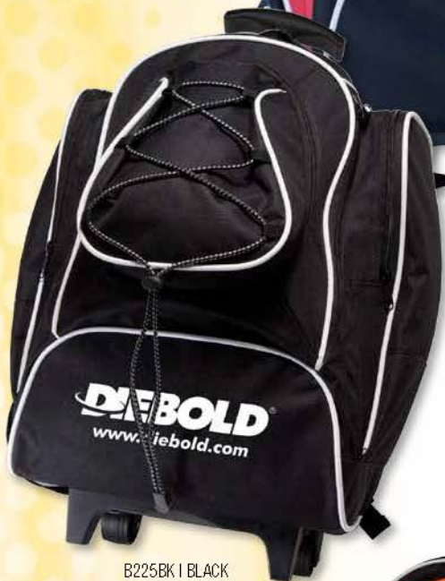
B225BK | BLACK