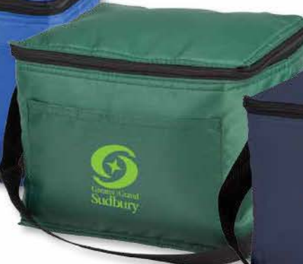
B101HG | HUNTER GREEN