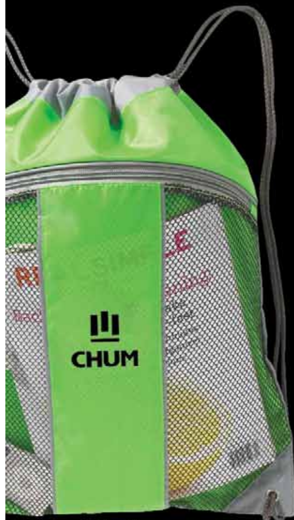
B571GN | GREEN

Lead and cadmium content in accordance with standards