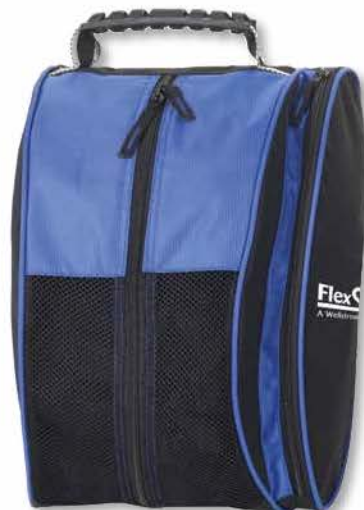
B522BL | BLUE