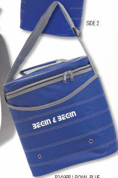
B349RB | ROYAL BLUE