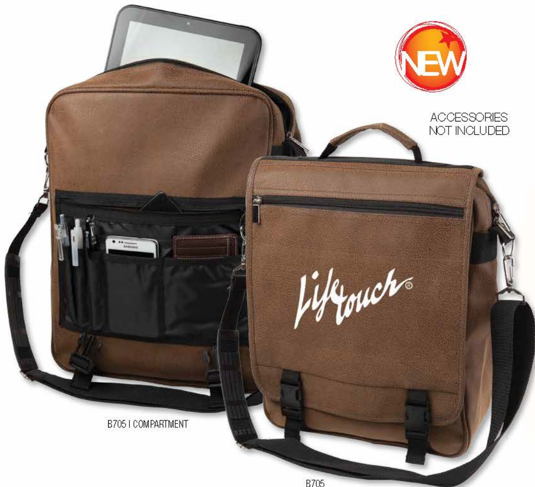
B705 | COMPARTMENT