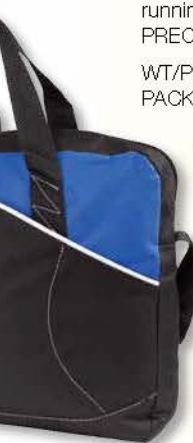
B189BL | BLUE