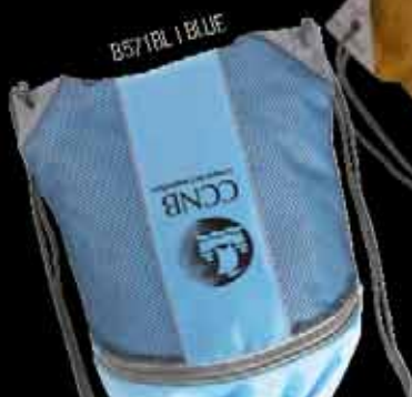
B571BL | BLUE