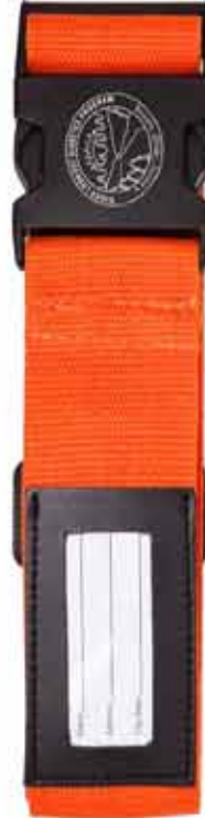
B 737OR | ORANGE