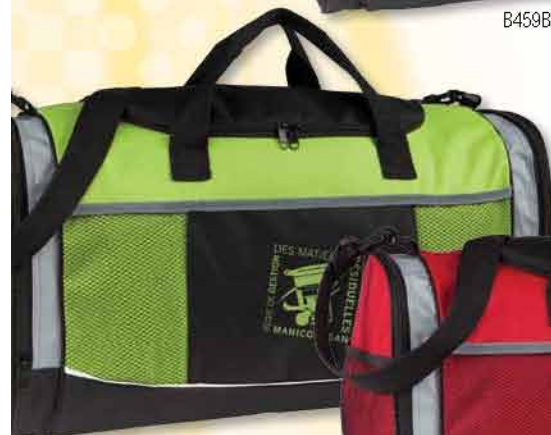
B459LG | LIME