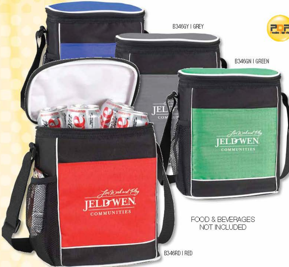
B346GN | GREEN