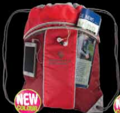
B571RD | RED