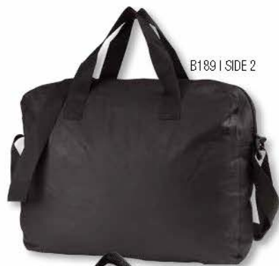
B189 | SIDE 2