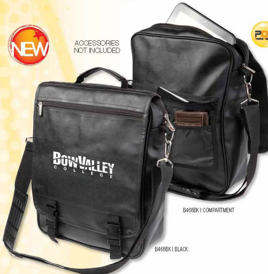
B468BK | COMPARTMENT