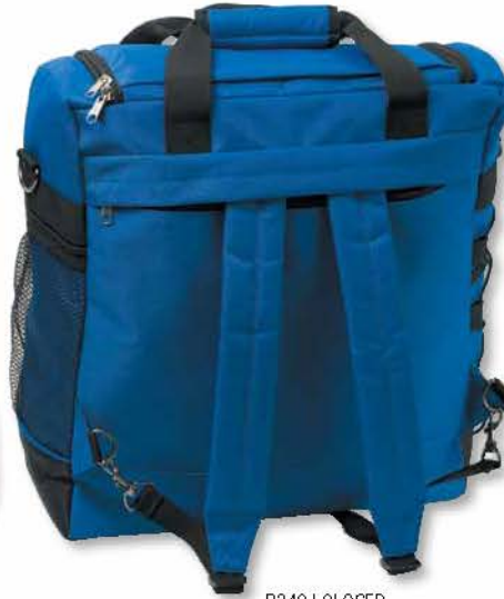
B340 | CLOSED