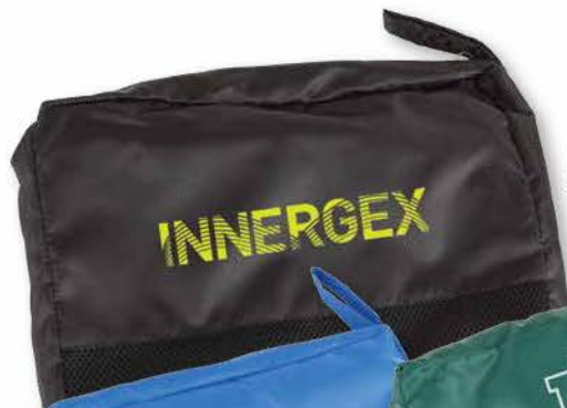
B131BK | BLACK