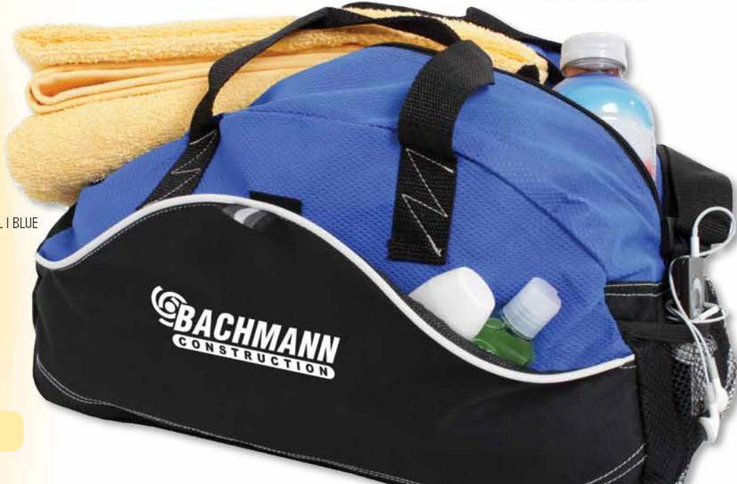
B140BL | BLUE