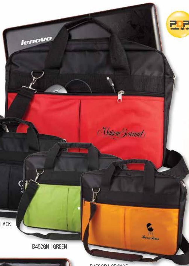
B452RD | RED