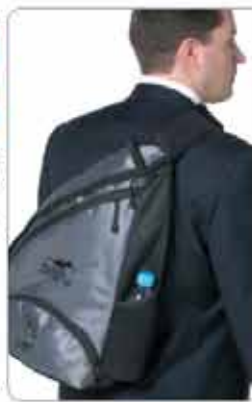
B450GY | GREY