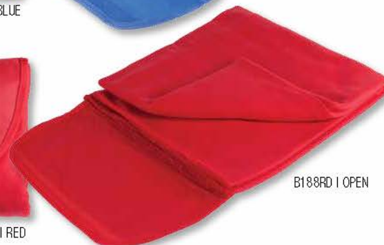
B188RD | OPEN