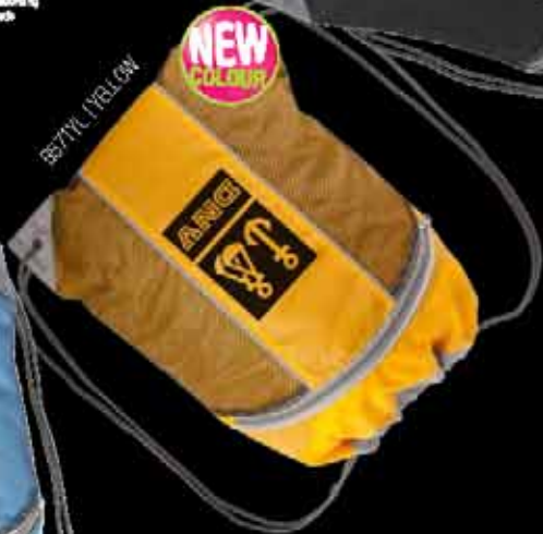
B571YL | YELLOW