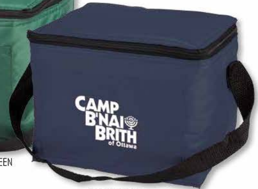
B101NV | NAVY