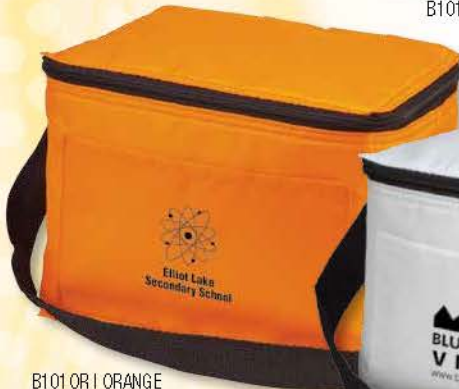
B101OR | ORANGE