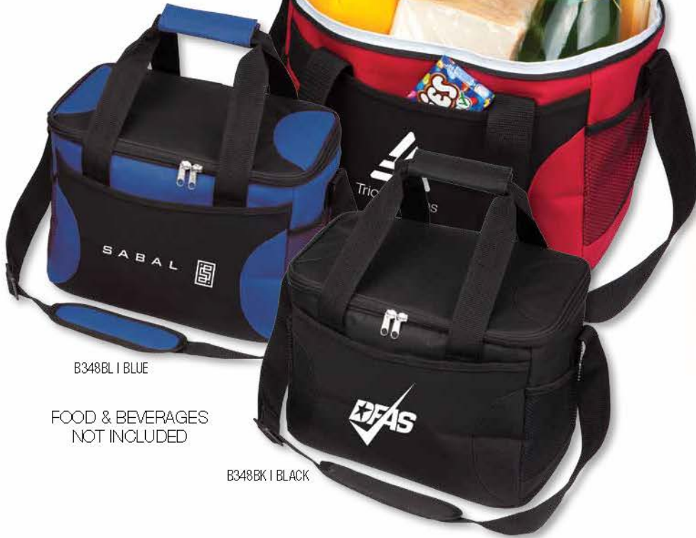
B348BL | BLUE