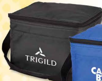
B101BK | BLACK

Lead-free ink solution according to accepted test standards