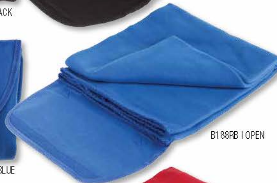
B188RB | OPEN