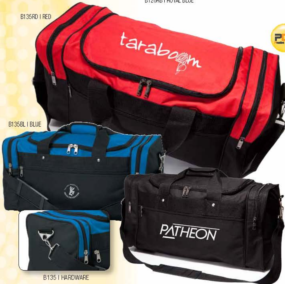
B135BL | BLUE