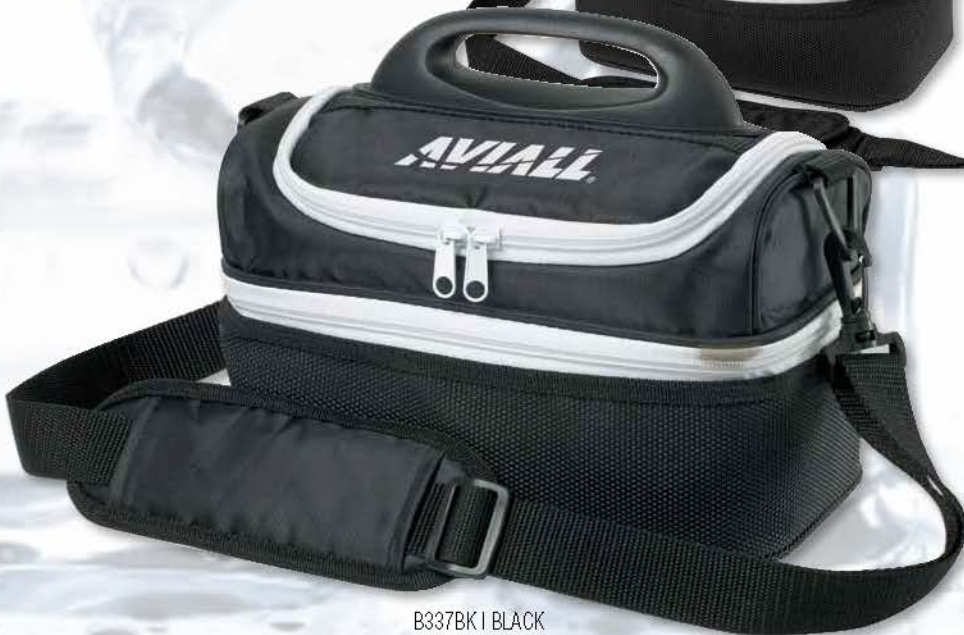
B337BK | BLACK