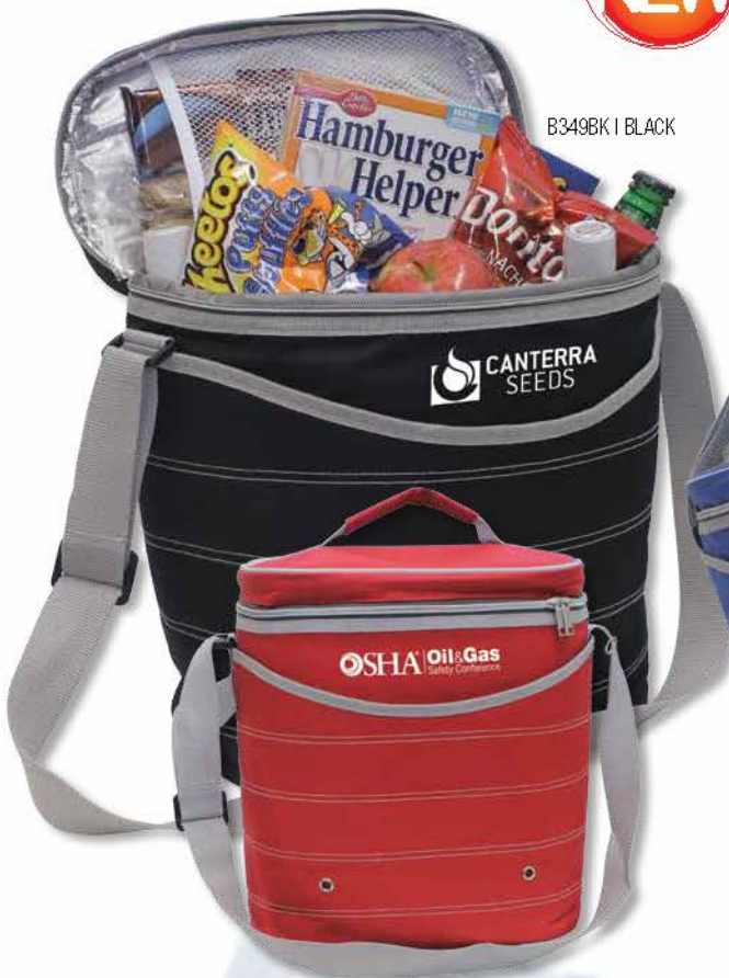
B349BK | BLACK