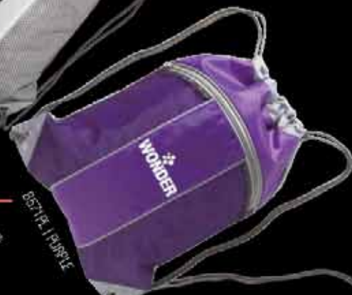
B571PR | PURPLE