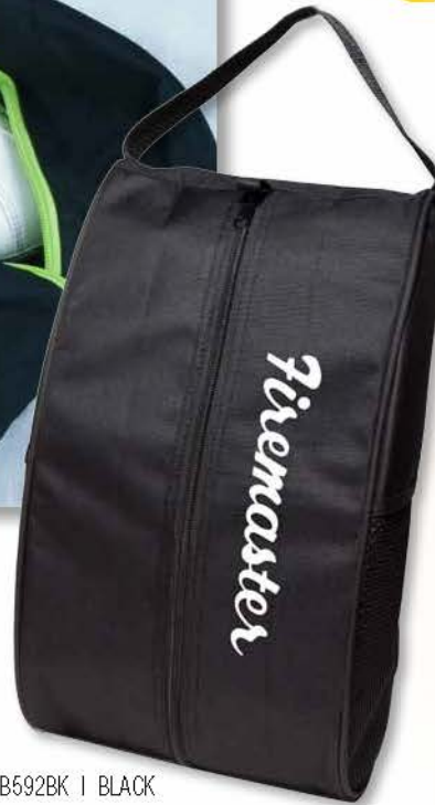
B592BK | BLACK