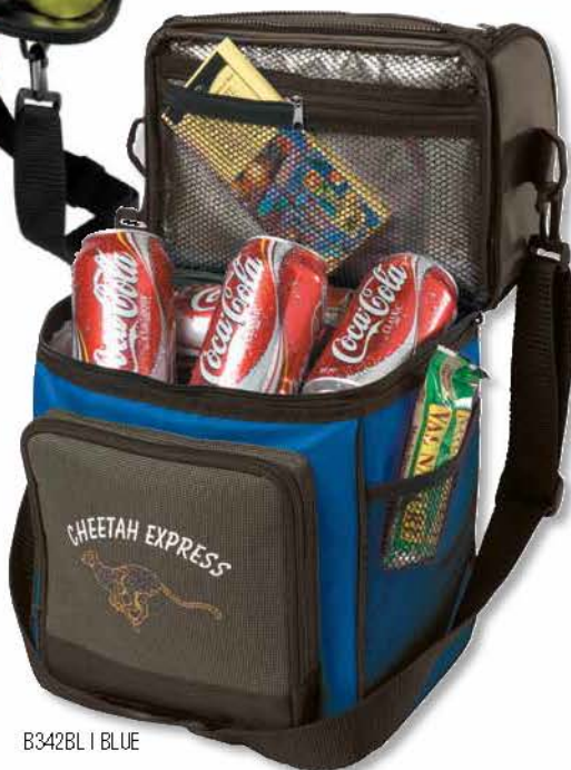
B342BL | BLUE