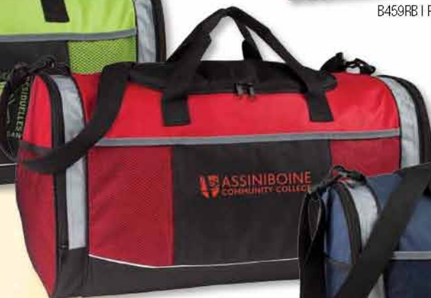
B459RD | RED