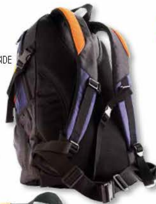
B232 | SIDE