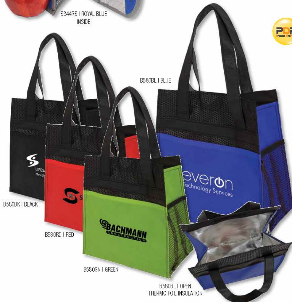
B580BK | BLACK

Lead-free fabrication according to accepted test standards