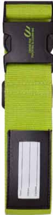
B 737GN | GREEN