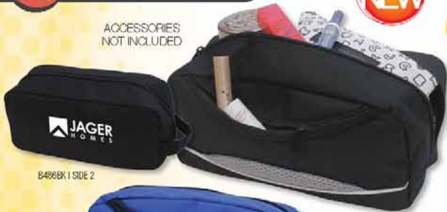
B486BK | SIDE 2