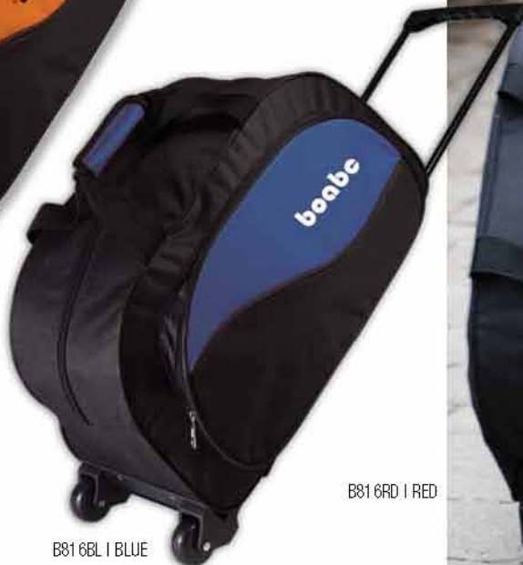
B816BL | BLUE