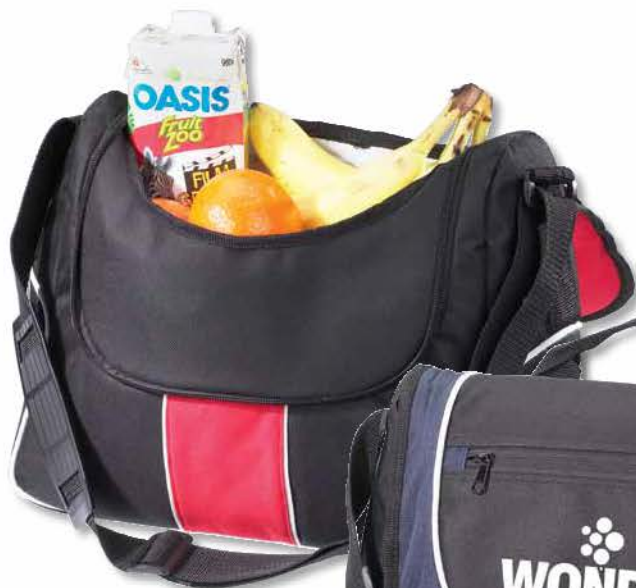
B341RD | RED

Lead-free fabrication according to accepted test standards