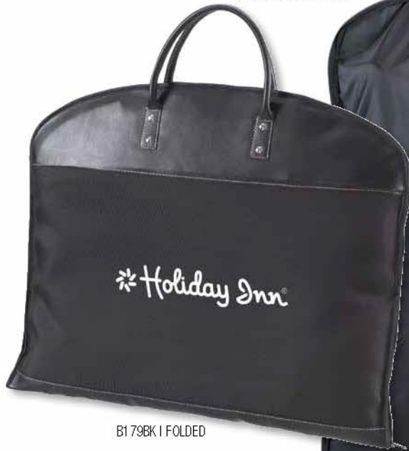
B179BK | FOLDED