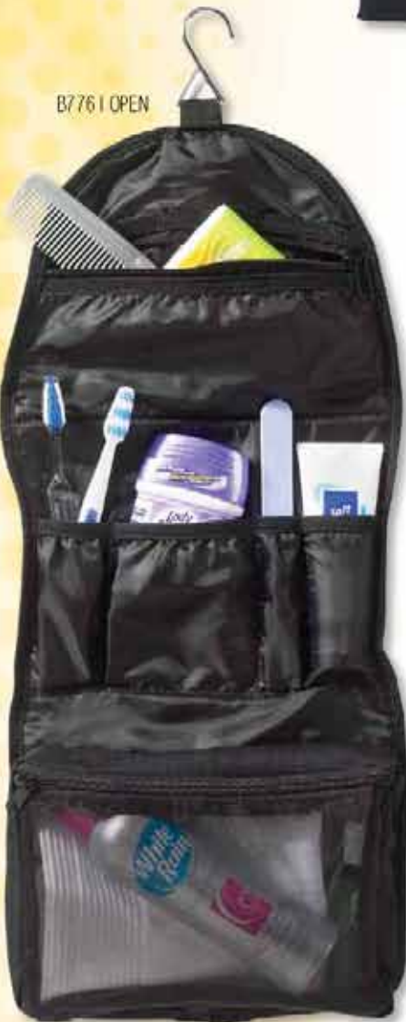
B776 | OPEN