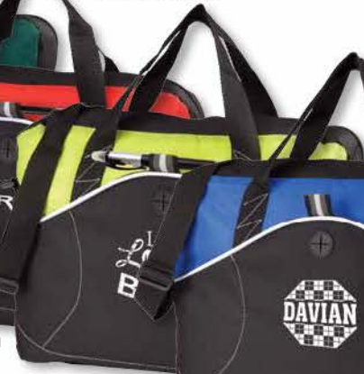
B189LG | LIME