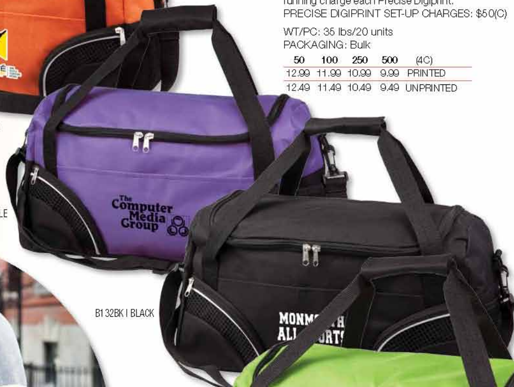
B132PL | PURPLE