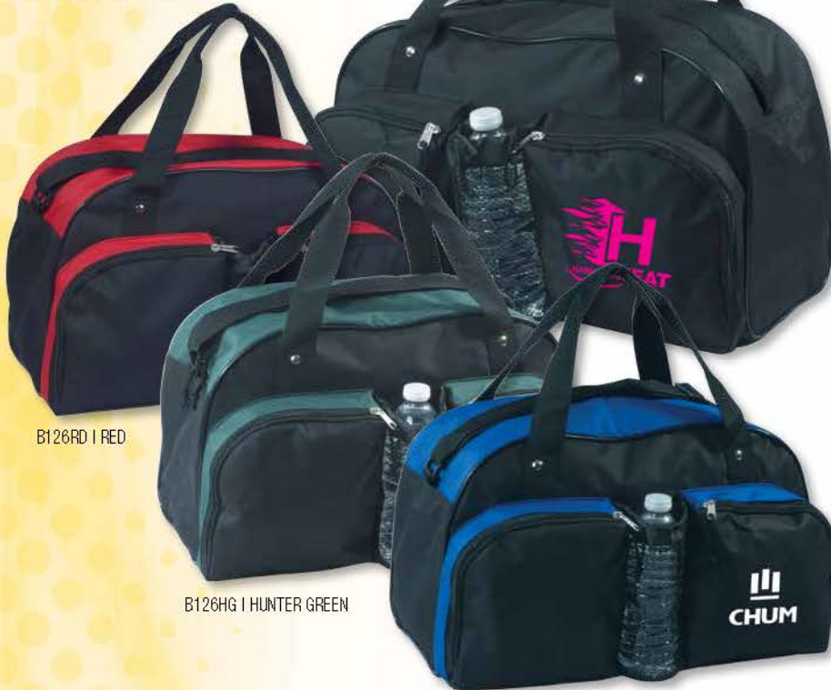
B126RD | RED