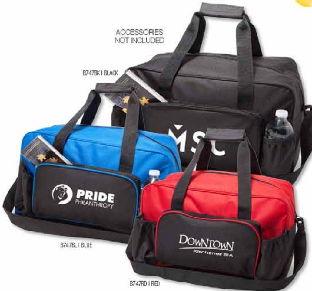
B747BK | BLACK