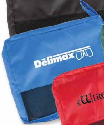
B131RB | ROYAL BLUE

Lead-safe fabrication according to accepted test standards