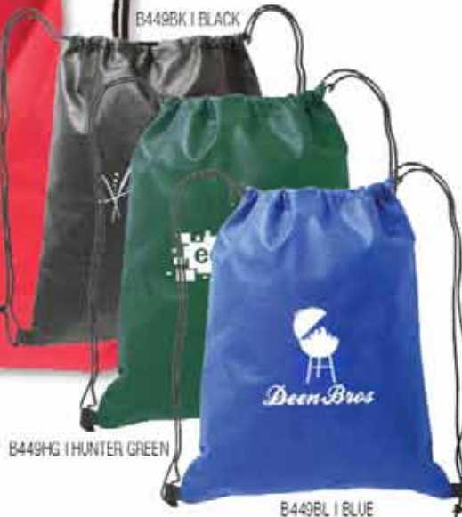
B449HG | HUNTER GREEN