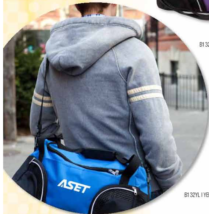
B132BL | BLUE