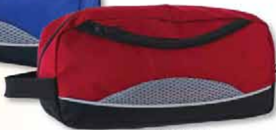
B486RD | RED