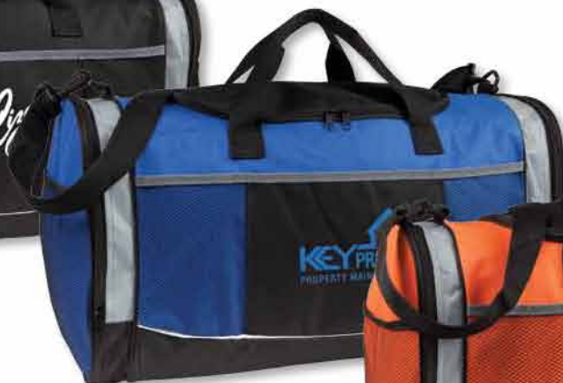
B459RB | ROYAL BLUE