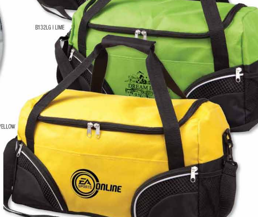
B132YL | YELLOW