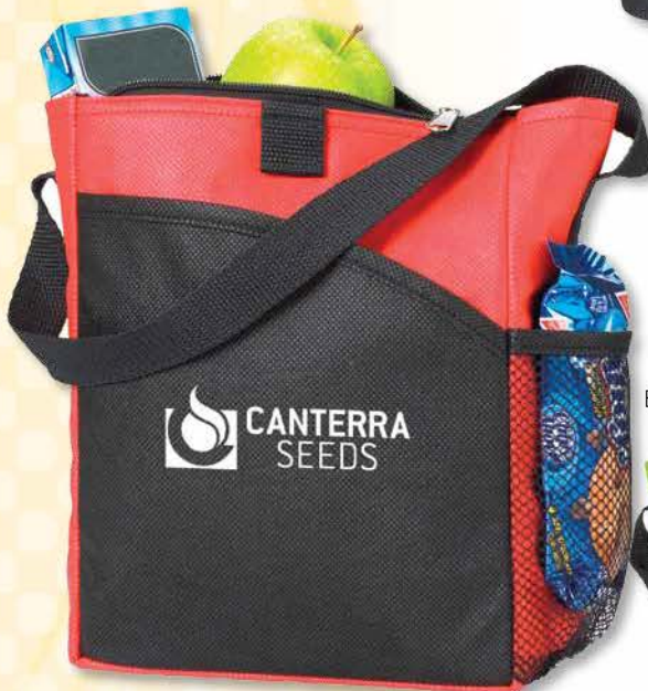
B429RD | RED