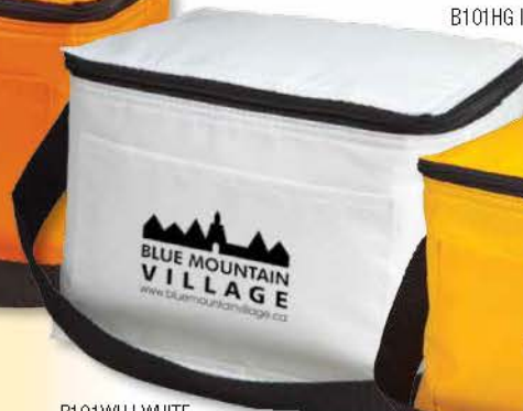
B101WH | WHITE