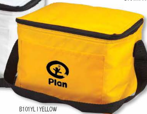
B101YL | YELLOW