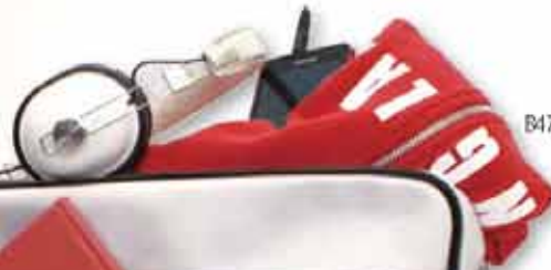
B470WH | WHITE