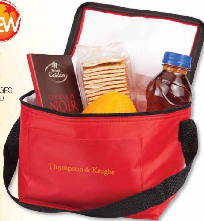
B101RD | RED