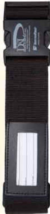
B 737BK | BLACK

Lead safe fabrication according to accepted test standards