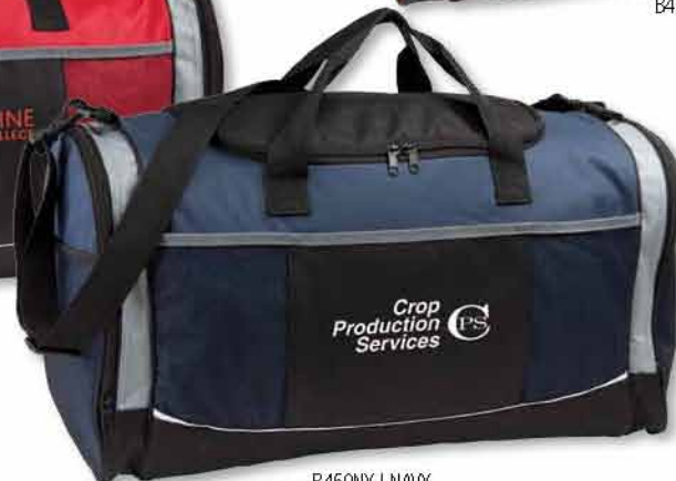
B459NY | NAVY