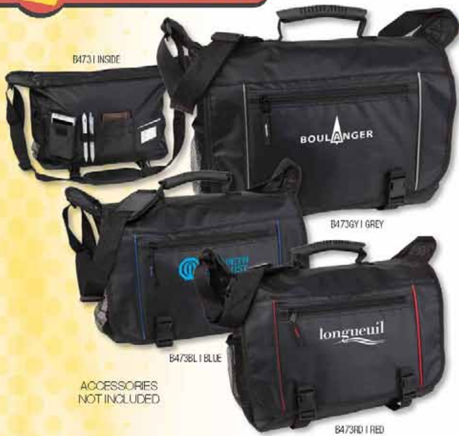
B473 I INSIDE