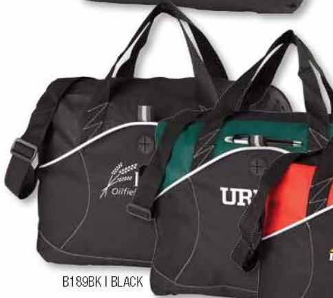
B189BK | BLACK