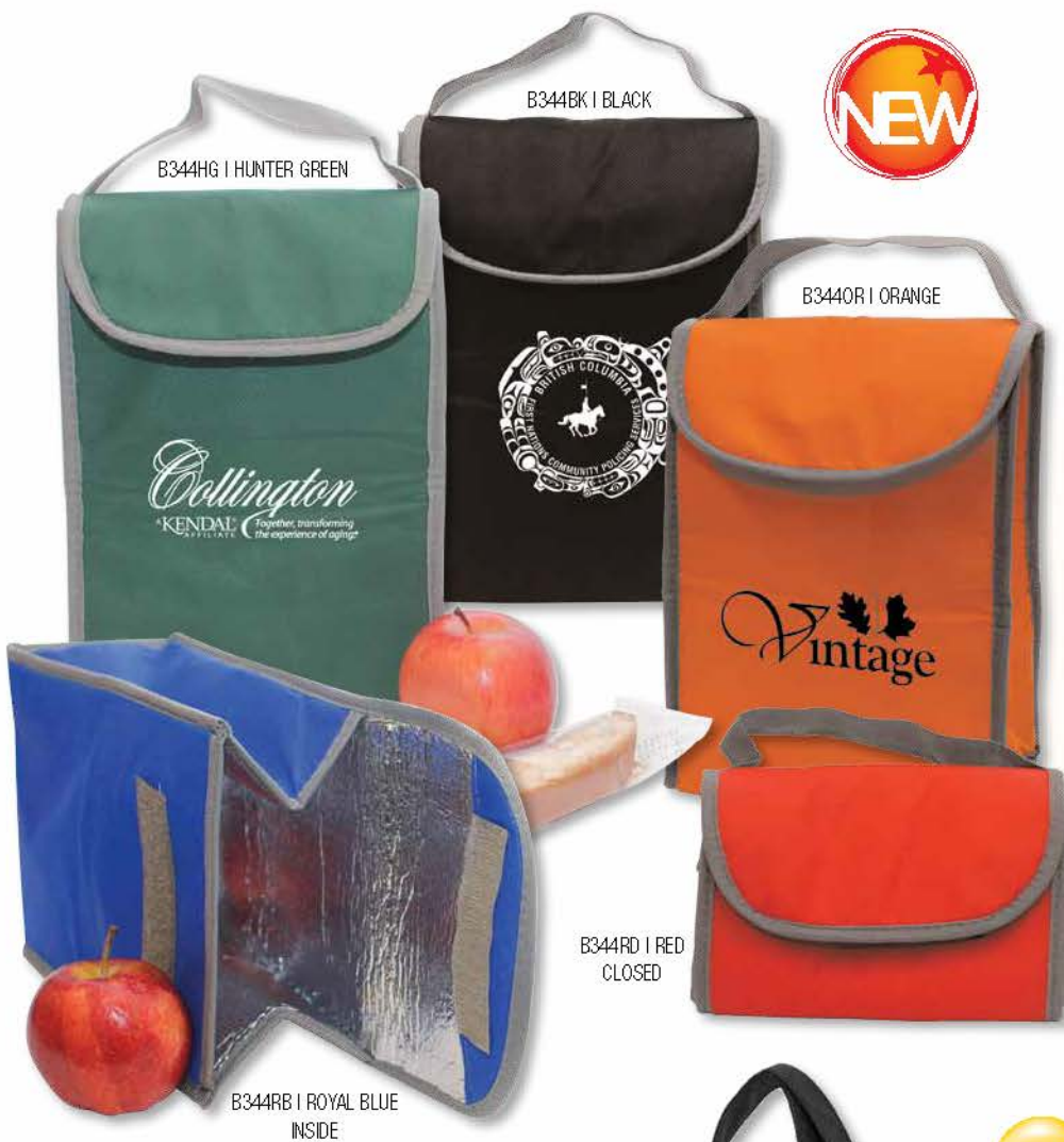
B344RD | RED CLOSED

Lead-free fabrication according to accepted test standards