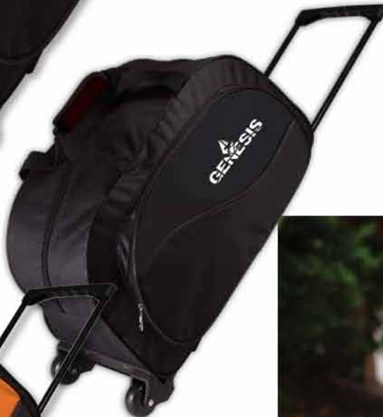
B816BK | BLACK