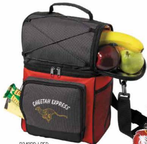
B342RD | RED

Lead-free fabrication according to accepted test standards