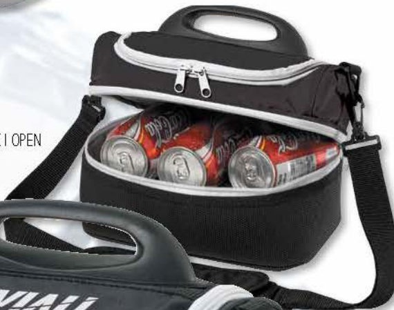
B337BK | OPEN