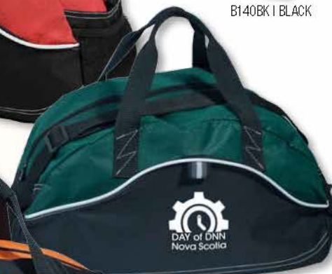
B140HG | HUNTER GREEN