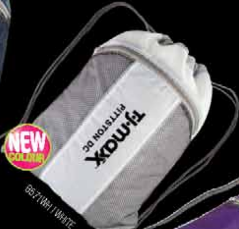
B571WH | WHITE