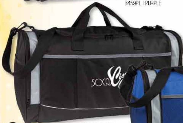
B459BK | BLACK