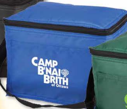
B101BL | BLUE