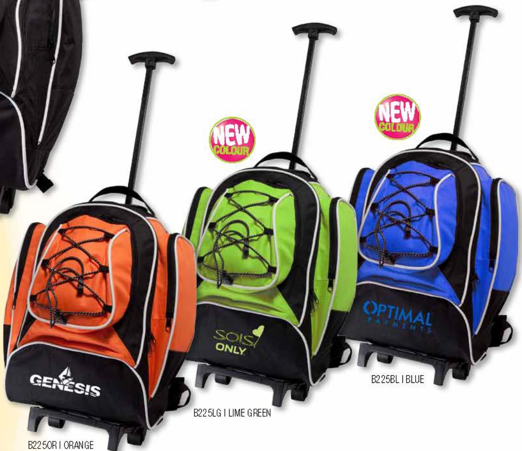
B225OR | ORANGE