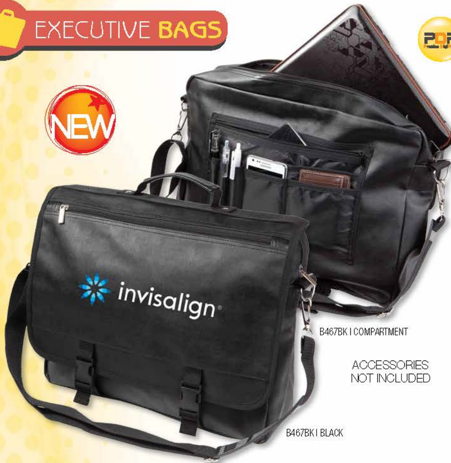
B467BK | COMPARTMENT