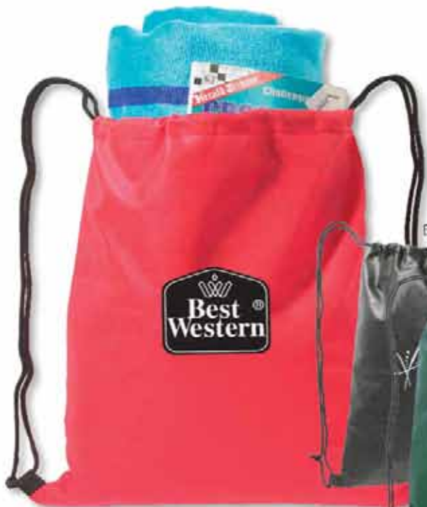
B449RD | RED

Lead-free inks according to accepted test standards