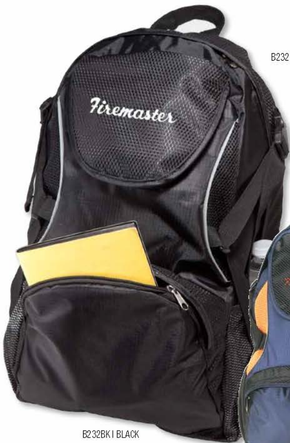
B232BK | BLACK