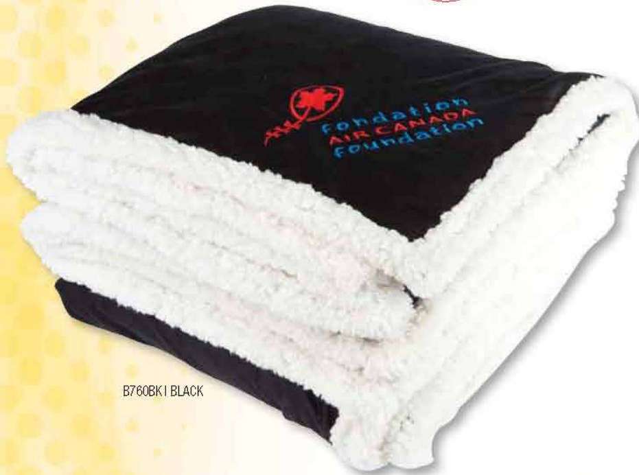
B760BK | BLACK

Lead-safe fabrication according to accepted best standards