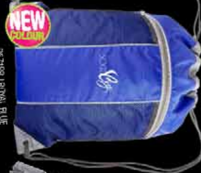
B571RB | ROYAL BLUE