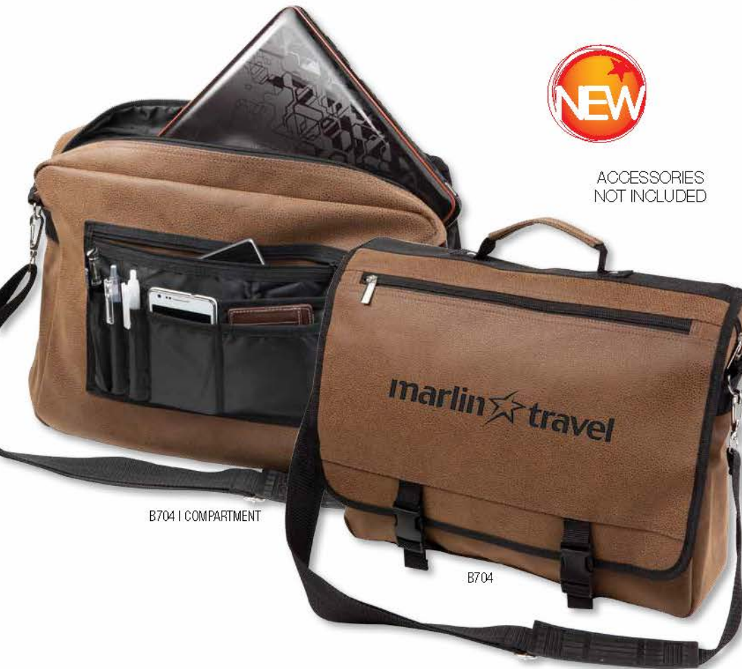
B704 | COMPARTMENT