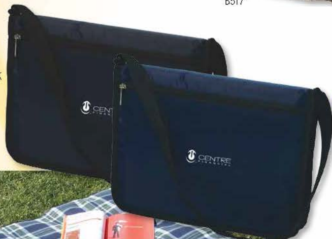
B770BK | BLACK