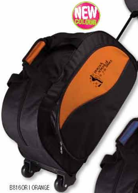
B816OR | ORANGE