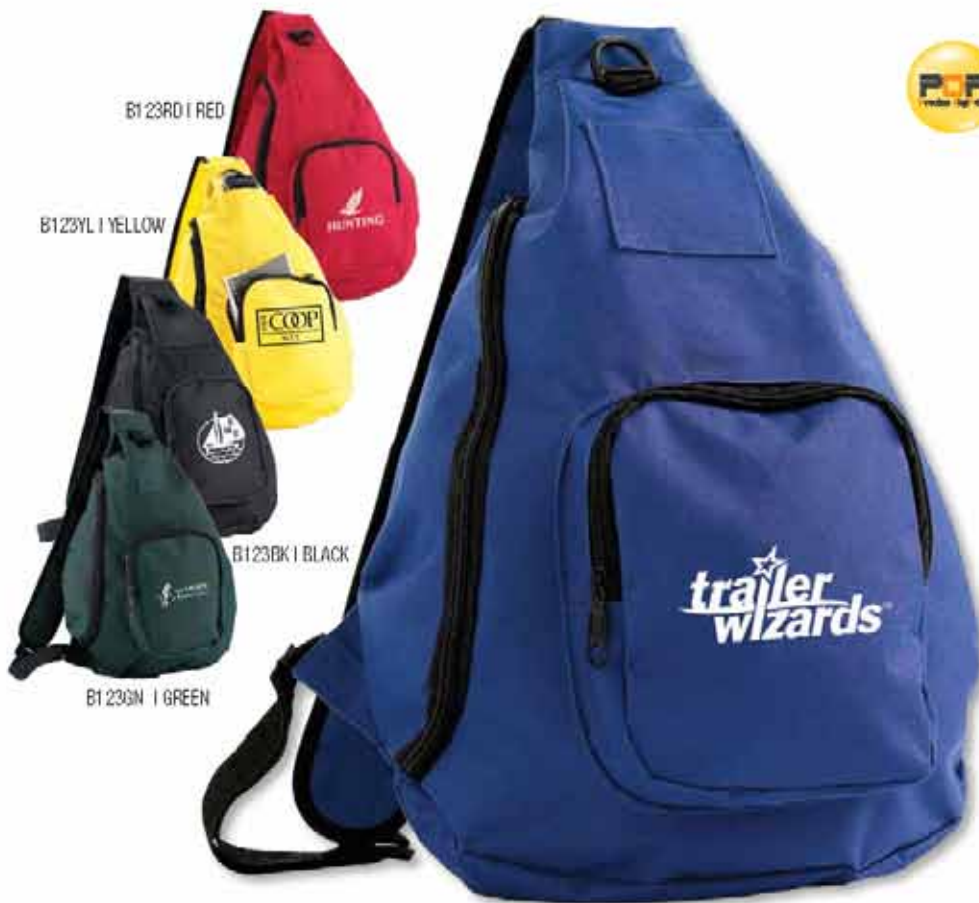
B123RD | RED