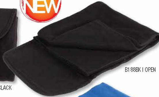
B188BK | OPEN