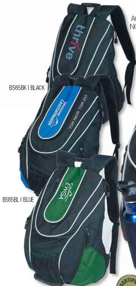
B585BK | BLACK