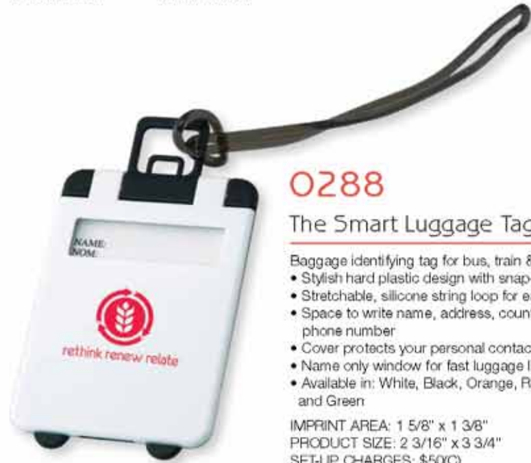
0288WH | WHITE