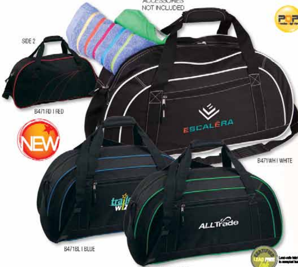
B471RD | RED