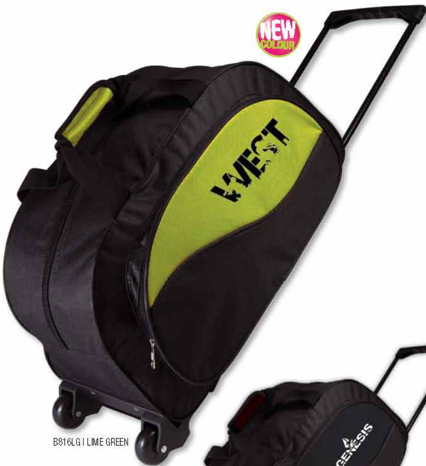
B816LG | LIME GREEN