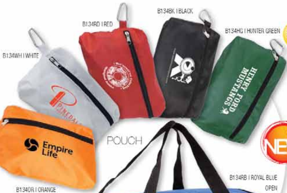
B134RD | RED