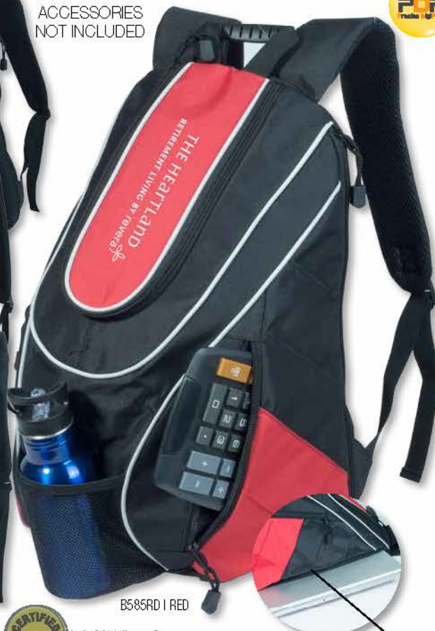
B585RD | RED