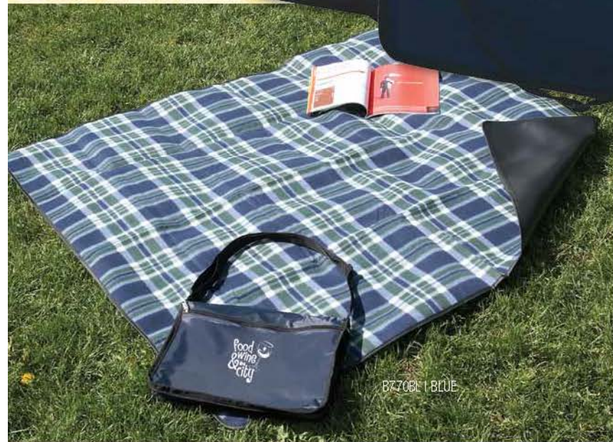
B770BL | BLUE