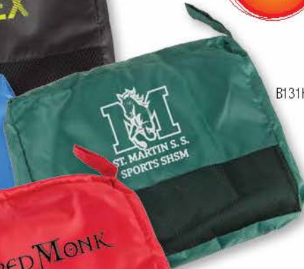
B131HG | HUNTER GREEN