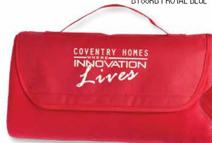
B188RD | RED