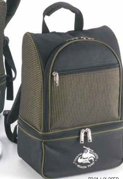
B301 | CLOSED