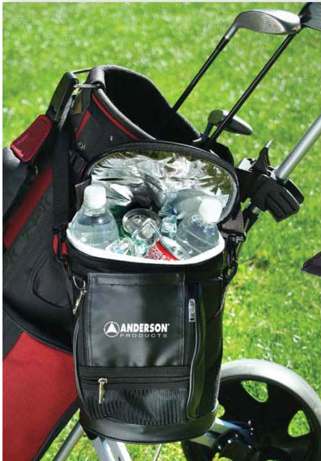
B533BK | OPEN