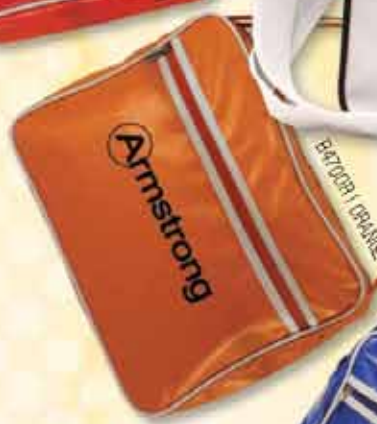
B470OR | ORANGE