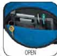
B450RD | RED

Lead-free inks available according to accepted test standards