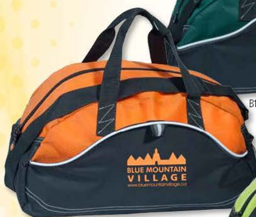
B140OR | ORANGE