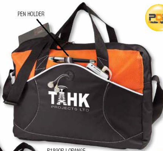
B189OR | ORANGE