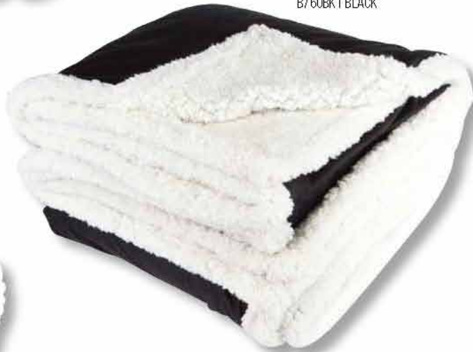
B760BK | BLACK