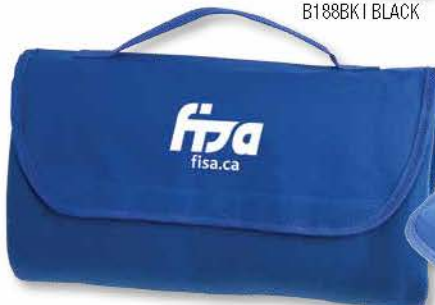
B188RB | ROYAL BLUE