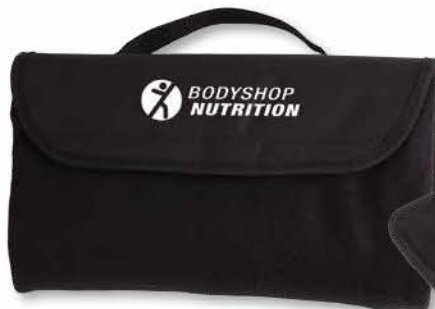
B188BK | BLACK