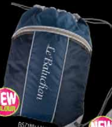
B571NV | NAVY