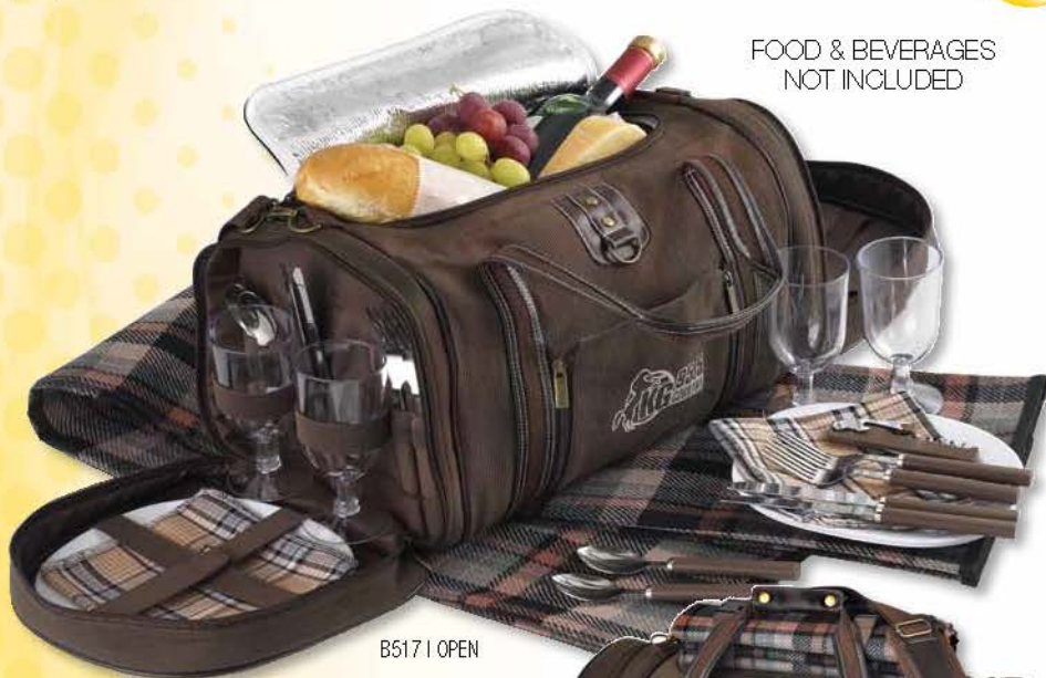
B517 | OPEN