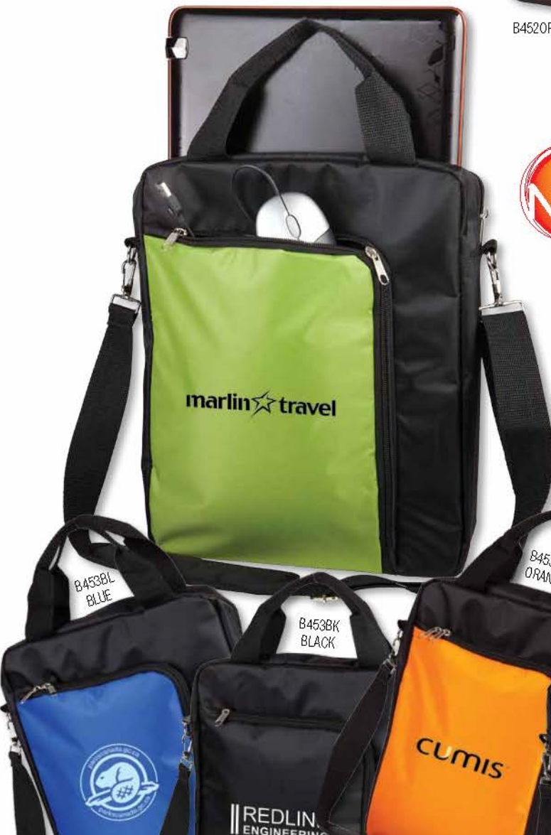
B453GN | GREEN

Lead-safe fabrication according to accepted test standards