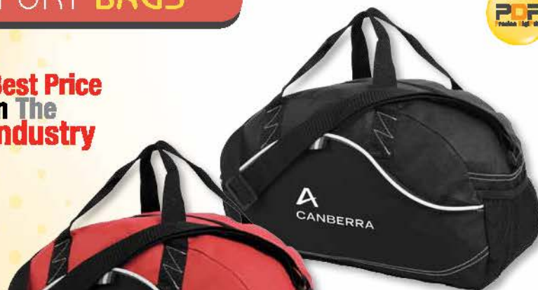
B140BK | BLACK

Lead-free fabrications according to applicable test standards