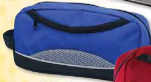
B486RB | ROYAL BLUE