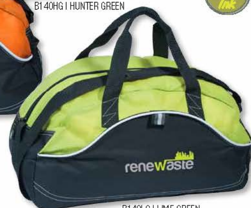
B140LG | LIME GREEN