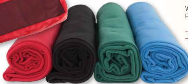
B131RD | RED B131BK | BLACK B131HG | HUNTER GREEN B131RB | ROYAL BLUE