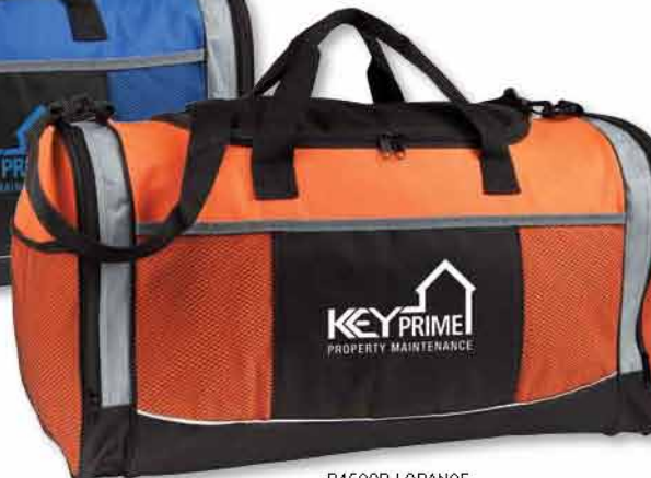
B459OR | ORANGE