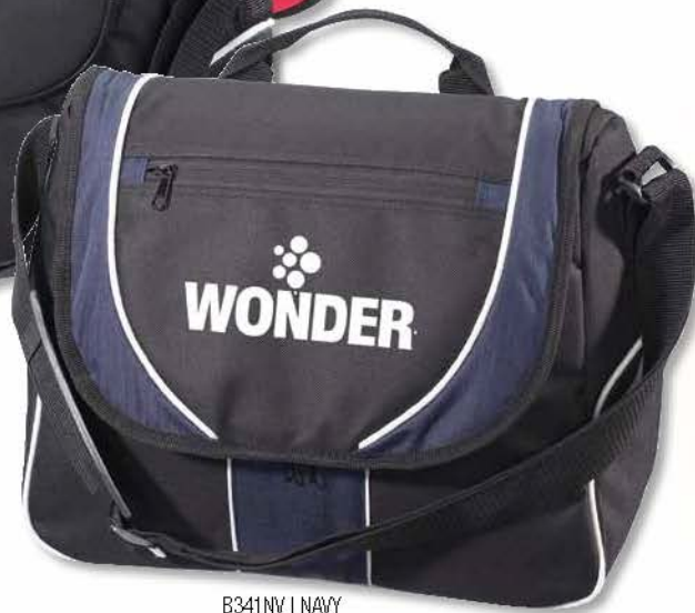
B341NV | NAVY