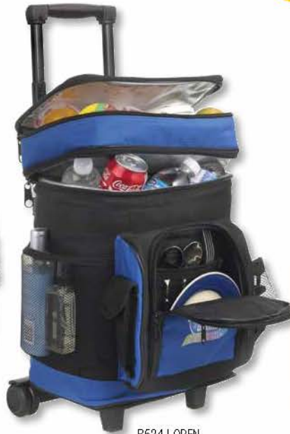
B524 | OPEN

NOTE: COOLER BAGS ARE ONLY FOR USE WITH ICE PACKS