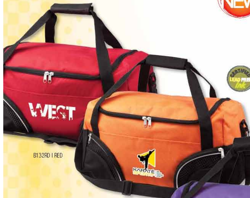
B132RD | RED

Lead-free fabrication according to accepted test standards