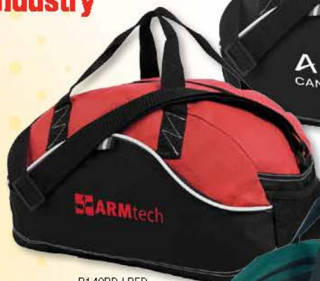
B140RD | RED