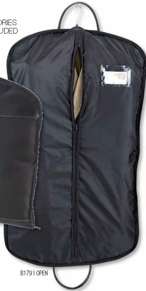
B179 | OPEN